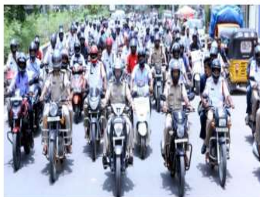
Fig.1. Helmet Safety Awareness

According to Global Status Report on Road Safety 2018 given by World Health Organization (WHO) [1], the number of deaths on the world's roads remains unacceptably high, with an estimated 1.35 million people dying each year due to road accidents. Out of these accidents more than half of all road traffic deaths are among vulnerable road users: pedestrians, cyclists and motorcyclists. Pedestrians and cyclists represent 26% of all deaths, while those using motorized two wheelers and three wheelers comprise another 28%. Also head injuries are the leading cause of death and major trauma for two- and three-wheeled motor vehicle users. Correct helmet use can lead to a 42% reduction in the risk of fatal injuries and a 69% reduction in the risk of head injuries. Hence, the use of a helmet is one of the most important factors in reducing the number of accidents. A total of 49 countries representing 2.7 billion people currently have laws on motorcycle helmet use that align with best practice. These days, wearing a helmet is compulsory across most of the states even in India. Most of the times the reason for the death is also because of the delay in the arrival of ambulance, absence of pupil at the site of accident to report the accident, etc. Thus, a lot of people die due to lack of treatment at the right time even after wearing helmets